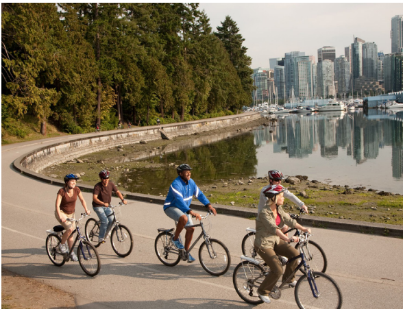
Top: Alhambra, Vancouver, BC. Bottom: Stanley Park Seawall, Vancouver, BC. Right: Gathering of Canoes in False Creek, Vancouver, BC