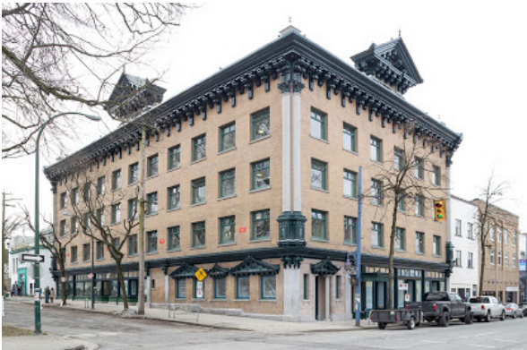
Top: Dr. Sun Yat-Sen Classical Chinese Garden, Vancouver, BC, Bottom: Tamura House, Vancouver, BC