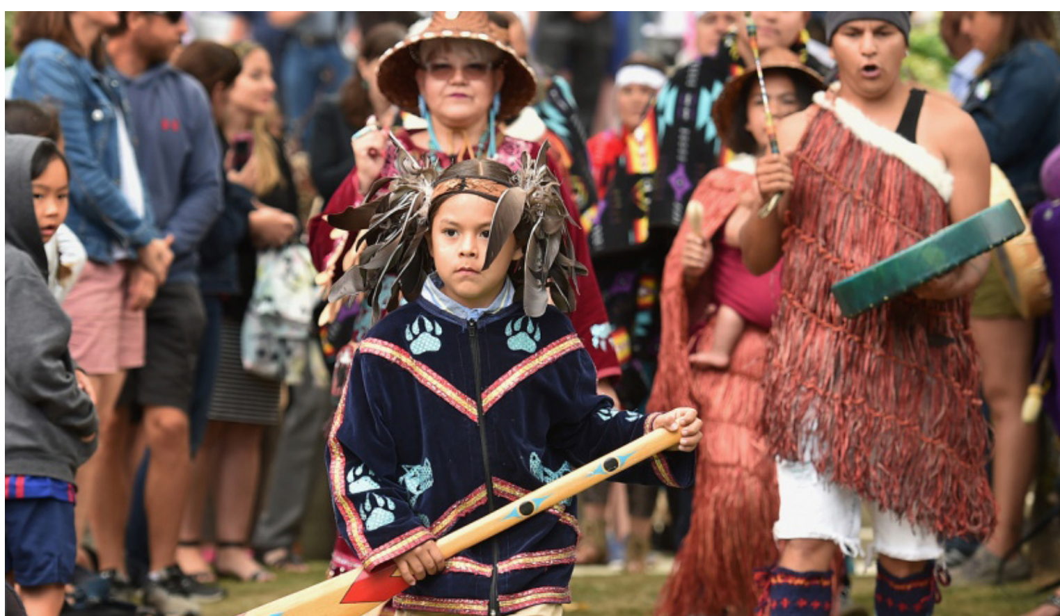
Members of the Coastal Wolf Pack, a traditional Musqueam dance group.