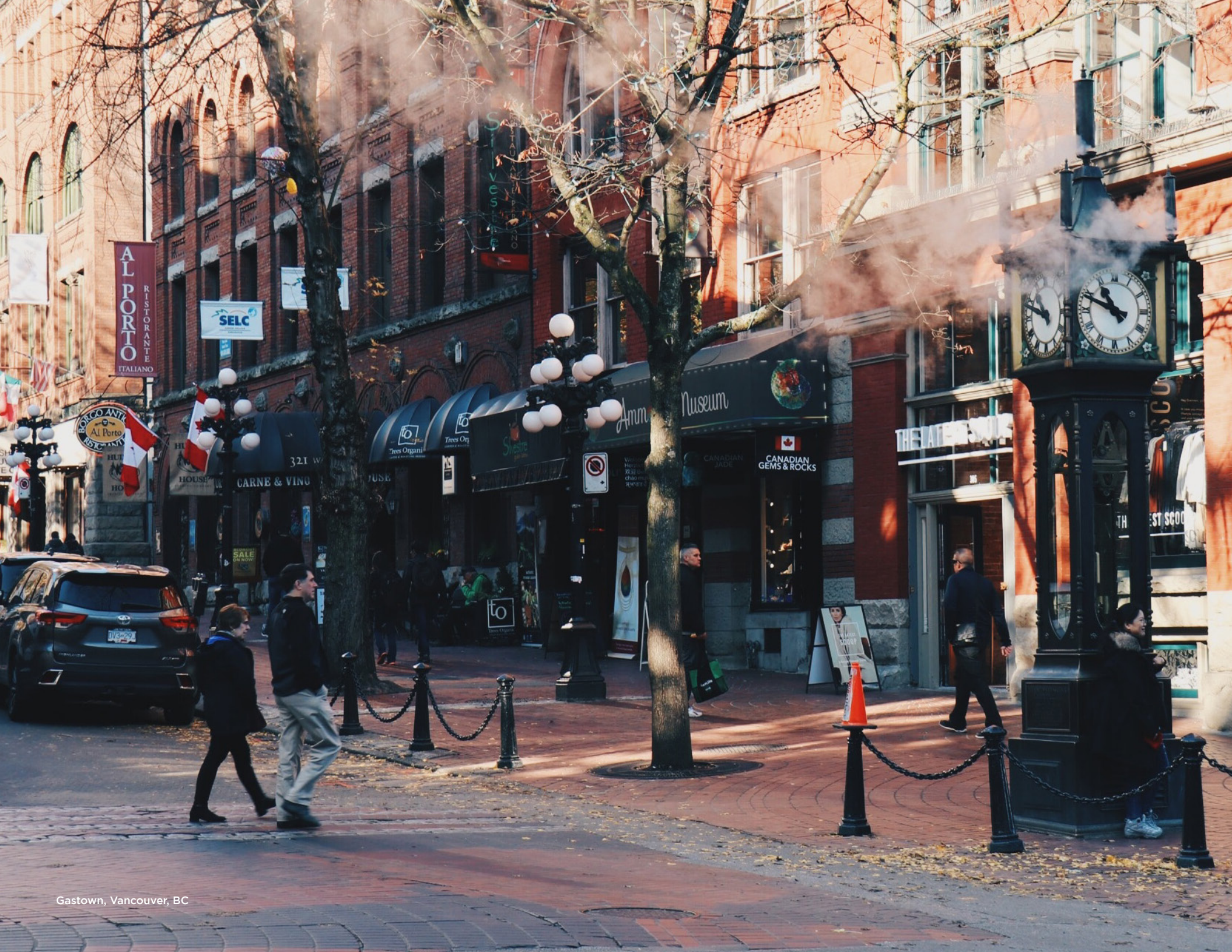
Gastown, Vancouver, BC