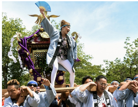
Top Left: African Descent Festival, Vancouver, BC, Top Right: Pinoy Fiesta, Vancouver, BC, Bottom Left: Diwali Festival, Vancouver, BC, Bottom Right: Powell Street Festival, Vancouver, BC