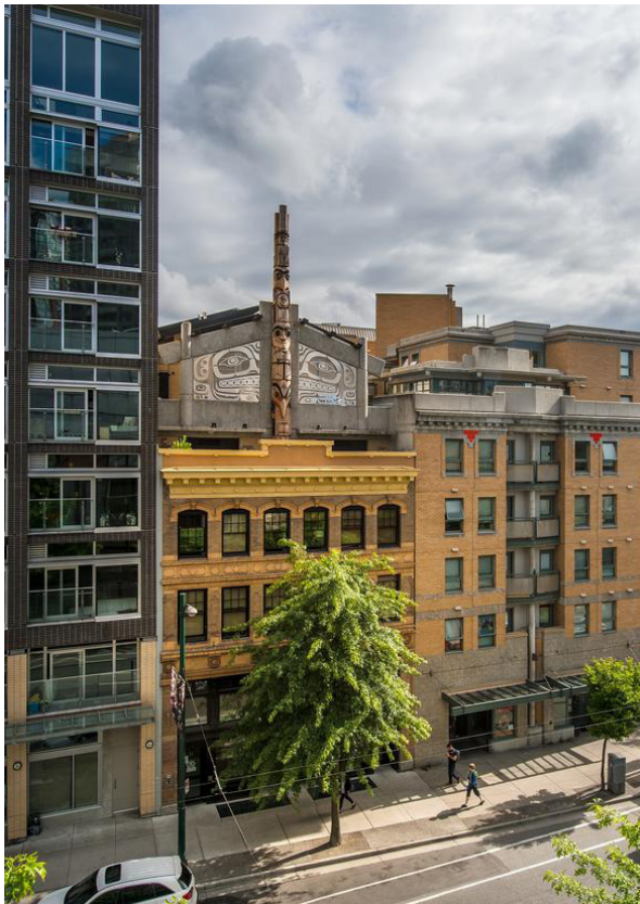
Skwachàys Lodge, Vancouver, BC

Provide leadership through clear and consistent heritage policies, effective heritage management tools, and meaningful heritage conservation incentives.